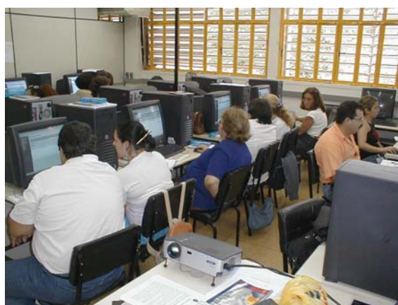
Figure 4 – Practical class

After the trainings, the teachers must elaborate and submit a conceptual project of a module. The projects are analyzed by a specialized team and developed by a team of technicians in computer science. The developed modules already developed at UNICAMP are available in http://www.mc21.fee.unicamp.br/~pgl/pgl.htm .