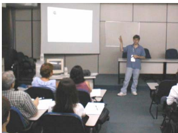
Figure 3 – Theoretical class

The trainings have a duration of 40 hours and, beside an introduction on computer literacy, the trainings cover the PGL methodology, web designing, tools for web designing, elaboration of web courses, and an introduction on LON-CAPA. The classes are separated in theoretical (Figure 3) and practices (Figure 4).